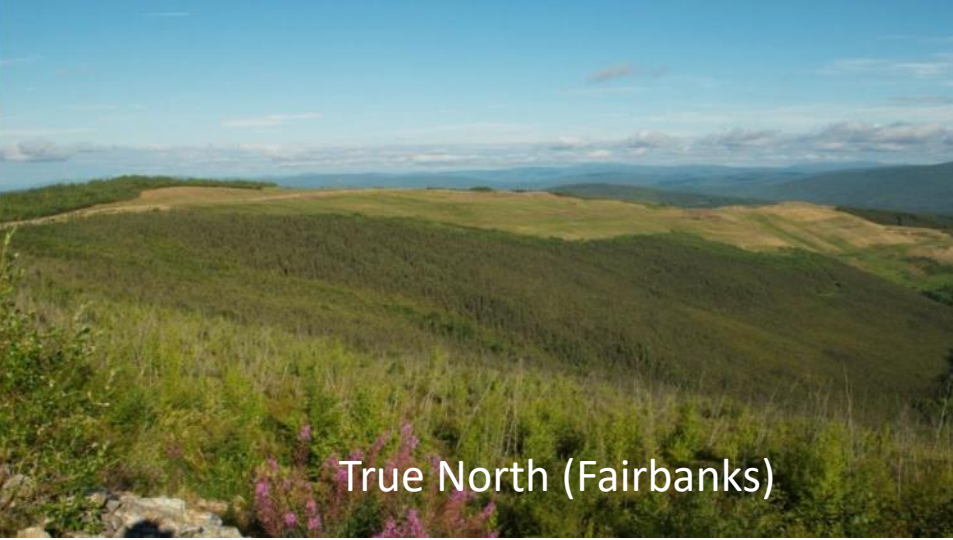
True North (Fairbanks)