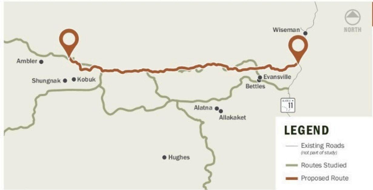
Figure 2 Proposed route from the Dalton Highway to Ambler District