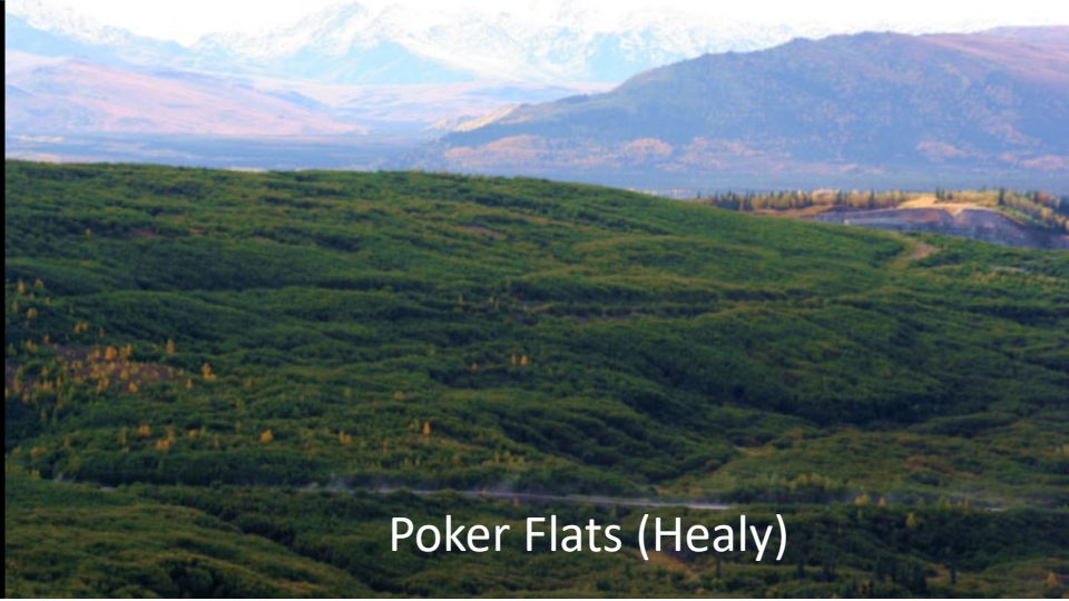
Poker Flats (Healy)